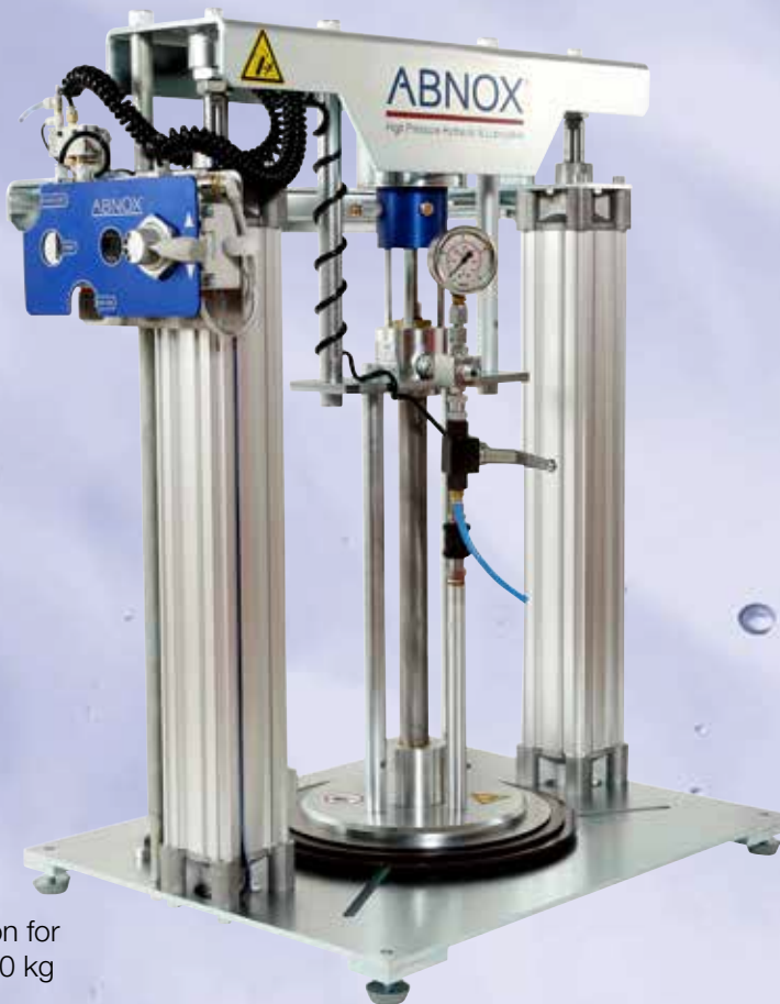
Version Light with one-hand operation for containers up to 50 kg