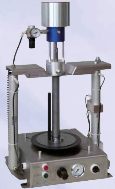
Drum pump type S for small containers up to 5 kg

Rational, fast, clean conveying directly from the original drums.